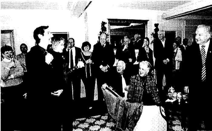
November 11, 2005, Symphony Social.