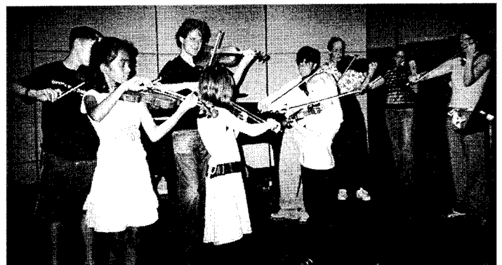
October 1, 2005, master class with Corey Cerovsek.