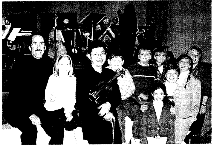
From morning of February 23rd, Young Person's Education Concert.